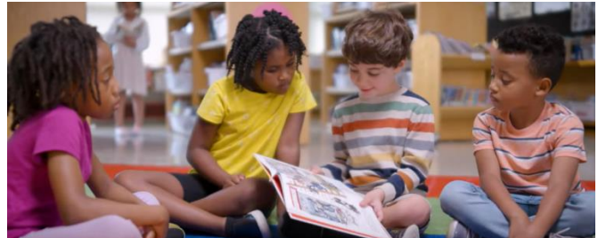
HopeWell’s RISE program provides children experiencing foster care with the building blocks they need to become strong readers and writers.

Last year, RISE tutors spent nearly 800 hours working on early literacy skills with dozens of children and caregivers around Greater Boston.